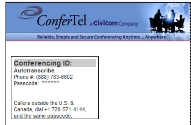
Figure A – Wallet Card